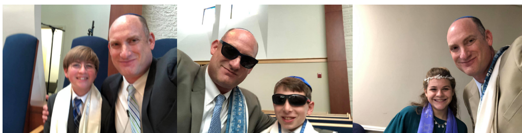
Rabbi selfies with our June b'nai mitzvah students