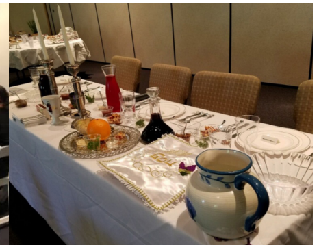
Thanks to everyone who came to the temple's Passover seder and all the volunteers who made it a success!