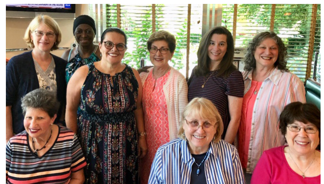
Board members enjoying lunch at the June Sisterhood meeting.