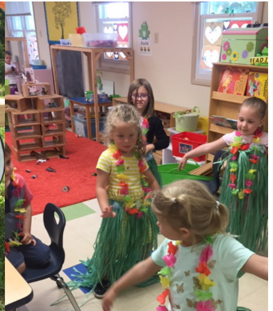
Summer Camp 2019